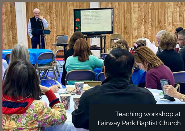
Teaching workshop at Fairway Park Baptist Church